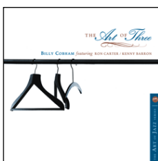
IOR CD 77045-2 Billy Cobham The Art Of Three